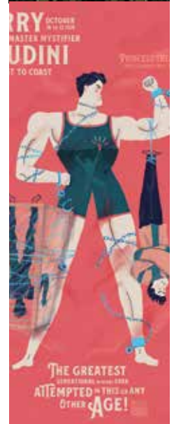
Details: Various Illustration winners of the 2018 Applied Arts Awards