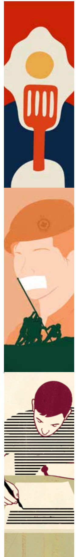
Details: Various Illustration winners of the 2018 Applied Arts Awards

Illustration that cannot reasonably fit in any other category, i.e. experimental, experiential, etc. Please include a brief description of up to 50 words if the application/usage/intention is not obvious.