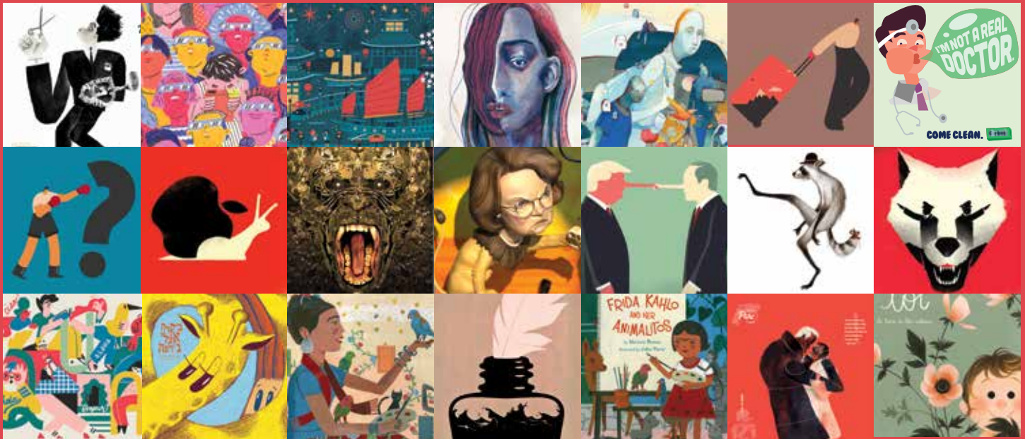
Details: Various Illustration winners of the 2018 Applied Arts Awards