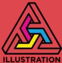
ILLUSTRATION AWARDS 2019 CATEGORIES