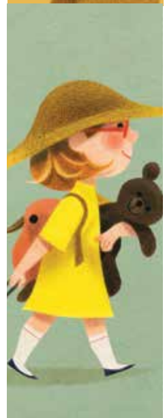
Details: Various Illustration winners of the 2018 Applied Arts Awards