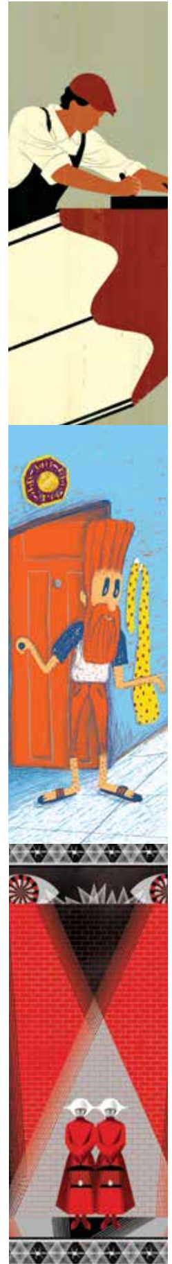
Details: Various Illustration winners of the 2018 Applied Arts Awards

Community Awards categories and eligibility details follow on page 6.