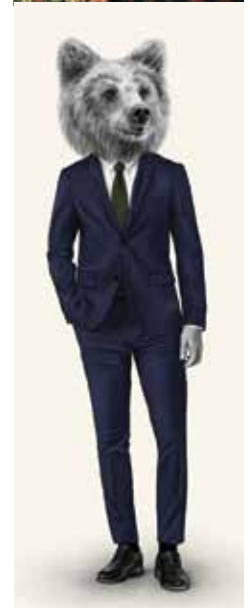
Details: Various Illustration winners of the 2018 Applied Arts Awards