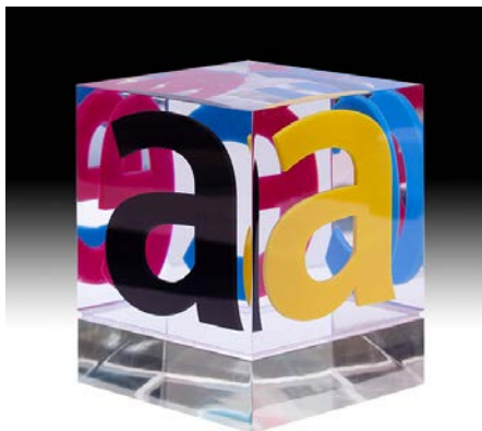
The AACE Cube trophy can be purchased for an additional fee.

All entrants will be notified by email by mid-March 2025 . Don't miss the results notification; be sure to add winners@appliedartsmag.com to your whitelist.